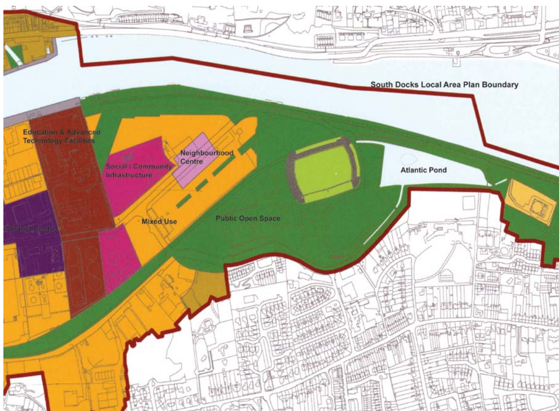
Figure 2 Current Cork City Development Plan Land Use Zoning Map 1.

'To rezone 6.82 acres of land currently zoned 'Public Open Space' to 'Sports Grounds' on the site of the former Munster Showgrounds' and consequent changes to text.